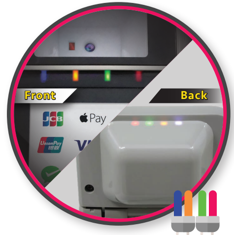
4 Color Indicators