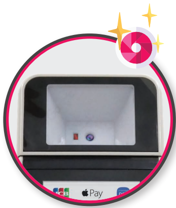
QR Code Reading Camera Light Sensor Camera for QR Code Reading